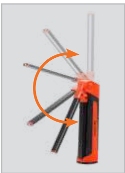
180° rotating light bar folds back to a compact pocket size worklight